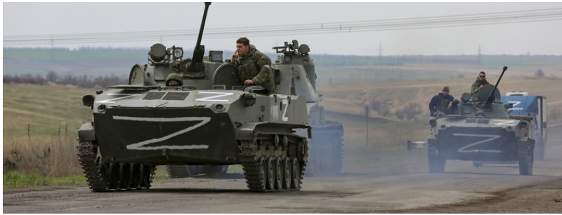
Russian military vehicles move on a highway in an area controlled by Russian-backed separatist forces near Mariupol, Ukraine, Monday, April 18, 2022. Mariupol.

For many years, I have studied and given much thought to the UN Charter's prohibition against aggressive war. No one can seriously doubt that the primary purpose of the document – drafted and agreed to on the heels of the horrors of WWII – was and is to prevent war and “to maintain international peace and security,” a phrase repeated throughout.