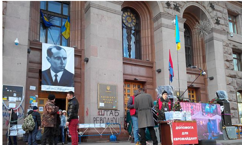
Portrait of Stepan Bandera outside the headquarters of the Maidan protests, 2014.

Battalion was formed in May 2014 out of the ultra-nationalist Patriot of Ukraine (founded in 2005) and the Social National Assembly or SNA (founded in 2008) that is “ known to have carried out attacks on minority groups. ” The Azov Battalion, Right Sector and other fascist militias played a key role in consolidating power for the post-coup government in numerous ways: engaging in street violence against the Left, running intimidation campaigns against uncooperative politicians, setting up indoctrination camps for children and youth, and exerting pressure on the government to revise the education curriculum, ban the Russian language, and rewrite official state history. This post-coup period of street violence and intimidation culminated in what some have called the worst Nazi atrocity since WWII, when some 42 leftists perished in an inferno set by fascists in the Odessa trade union building.