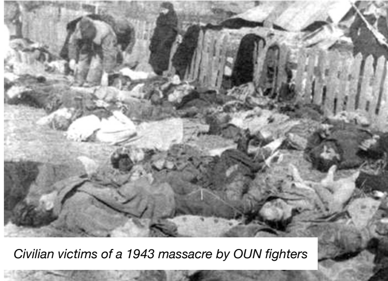
Civilian victims of a 1943 massacre by OUN fighters

they were both part of the Union of Soviet Socialist Republics, which was founded on the principle of the self-determination of nations. This was violently interrupted in 1941, when the Nazis invaded the USSR, taking over much of Ukraine.